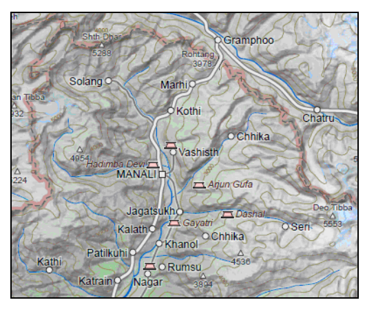
Fig. 5 Section of topographic map (1:500.000)