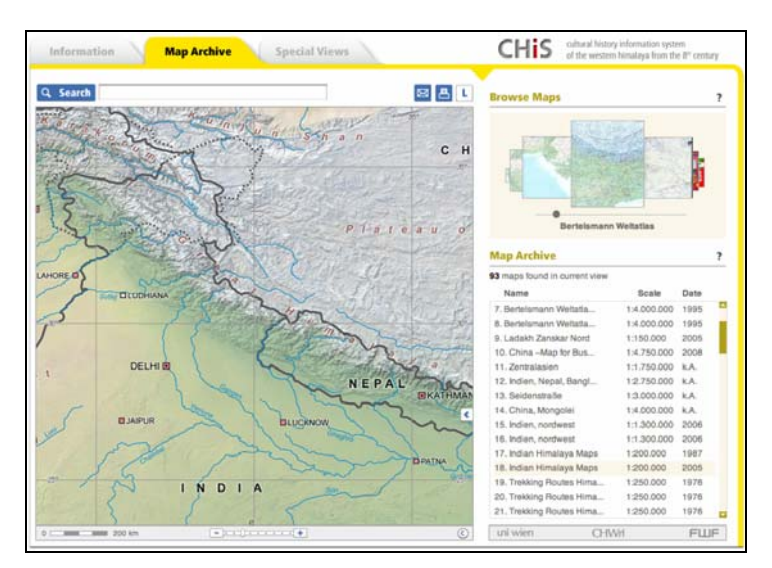
Fig. 2 The CHIS Map Archive

The map archive is a compilation of printed maps that have been digitized or carried together from various online sources. These maps are available for download by the users and can be selected not only by sorting through a list of various map criteria but also by selecting them geographically by their extent on the CHIS system map. The Browse Maps area shows a preview image of the maps respectively the map covers. Maps produced as part of this project are also available via the integrated map archive.