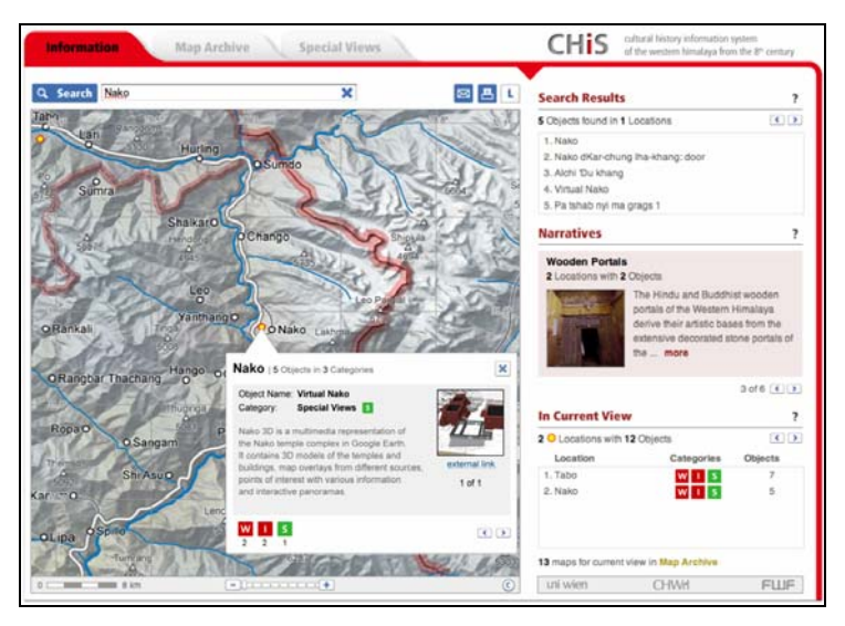
Fig. 1 The Cultural History Information System's Information section