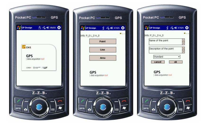
Fig. 4 Start-up screen and interface of GDAT

an easy-to-use GPS Data Acquisition Tool (GDAT) for mobile devices. The software for project partners and scholars in the fields of cultural history was designed to work on all GPS-enabled windows mobile devices, thus guaranteeing a wide availability of the service. By simultaneously capturing exact coordinates with the aid of GPS together with the object information such as images and descriptions, the archives can be made more valuable and sustainable and the work of the CHIS group can be greatly facilitated.